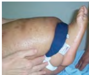
Crescent to lift fold