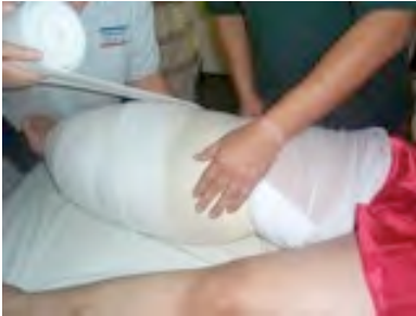
Rosidal Soft padding

Multiple layers of foam padding were used for added compression, then short stretch bandages were applied.