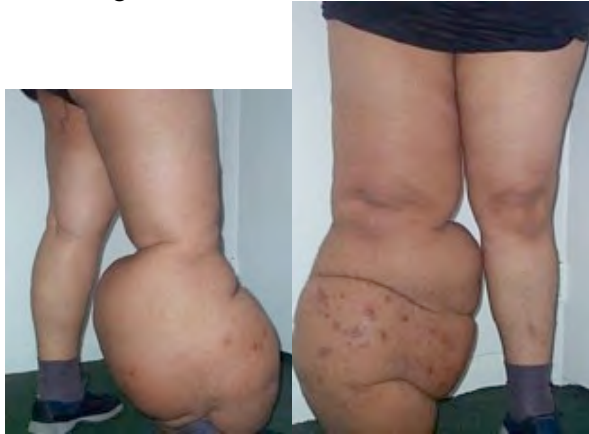
Primary Lymphedema of the right leg

Physical Appearance: Her right leg was very edematous, with the majority of the edema between the knee and the foot. The skin was taut with the pores distended and lymph fluid leaking. The calf was hard and fibrotic and extended out so far that it appeared as a shelf. There were multiple folds over the foot that hung to the floor so that the ankle was not evident.