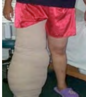
Full leg bandage

As the folds on the bottom softened and emptied, the problem became lifting the folds so they did not touch the floor. Special bandaging techniques were used to hold and provide shape to the softening tissues.