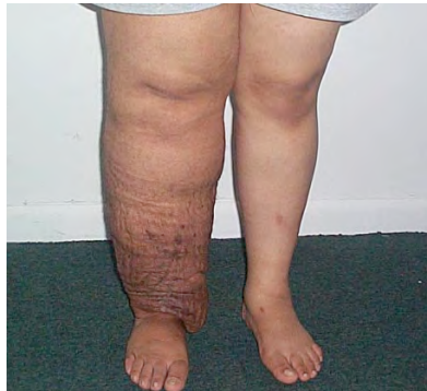
After 50 treatments. Folds empty